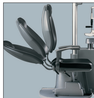
Swivel refraction chair