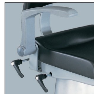
Variable arm rest