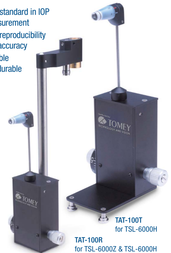
TAT-100T for TSL-6000H TAT-100R for TSL-6000Z & TSL-6000H