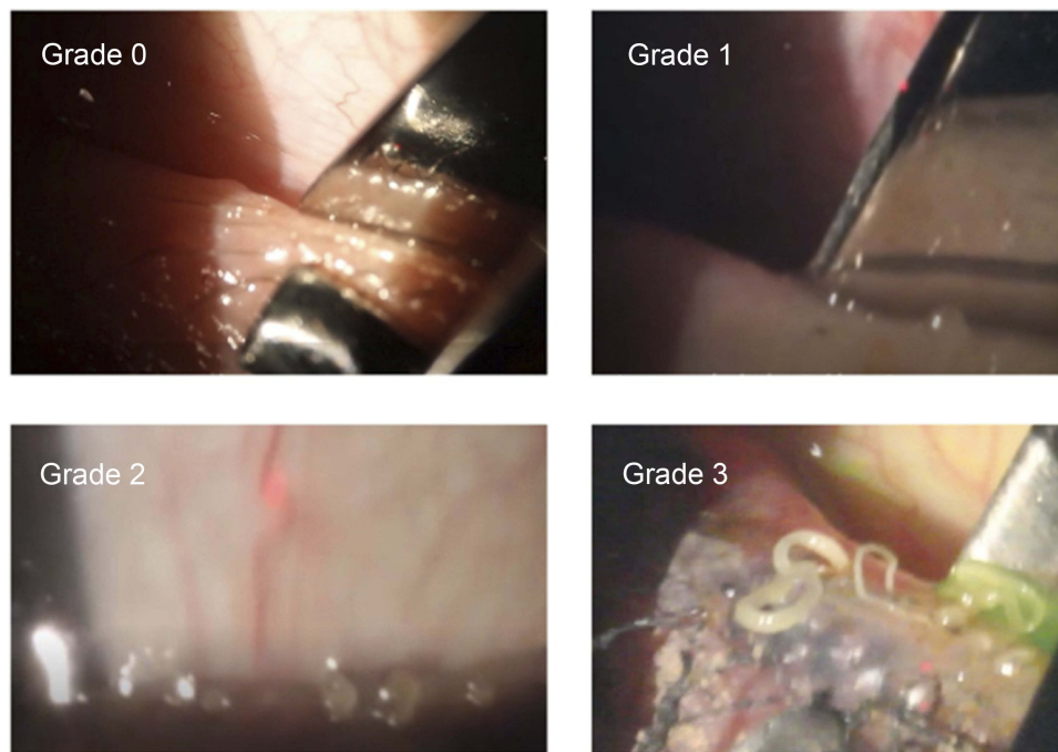
Figure 1 The MGD subjective grading scale.

Notes: Grade 0 is normal meibum easily expressed. Grade 1 is meibum easily expressed, but with with a more turbid oil. Grade 2 includes the presence of more turbid oil and a more viscous appearance. Grade 3 is the expression of “ropy” meibum. Grade 4 is no expression from the glands despite multiple attempts.