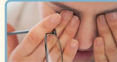
DISCOMFORT AT THE END OF THE DAY