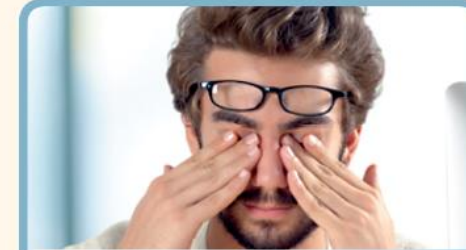
FOREIGN BODY SENSATION