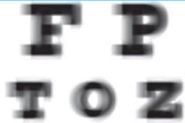
OCCASIONAL ALTERED VISION

DED most commonly appears as eye dryness and overall eye discomfort but patients may also feel (1, 2, 27):