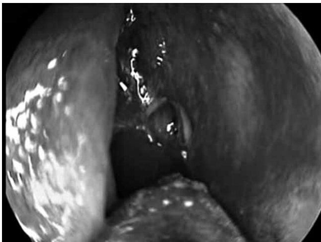
Fig. 3. Size of an ostium at postoperative month 24.